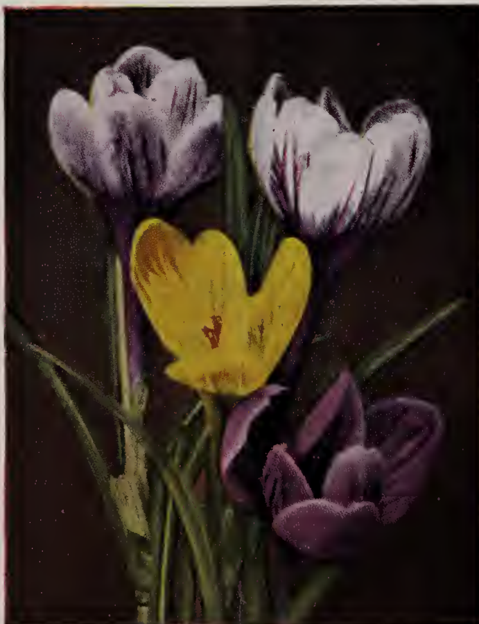
Large Flowering Crocus